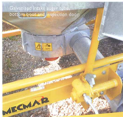
Galvanised intake auger tube, bottom boot and inspection door