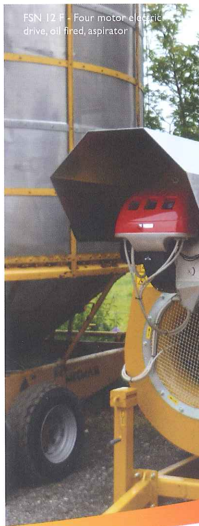
FSN 12 F - Four motor electric drive, oil fired, aspirator