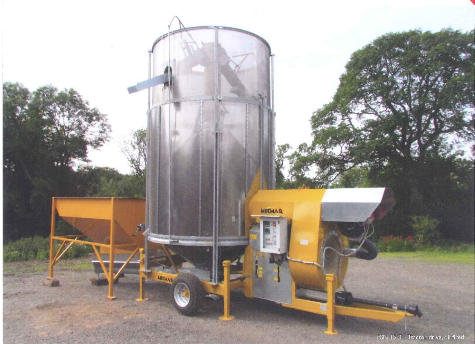
FSN 15 T - Tractor drive, oil fired