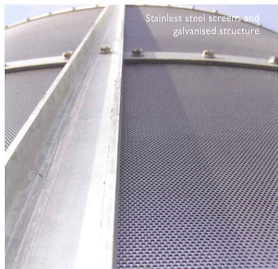
Stainless steel screens and galvanised structure