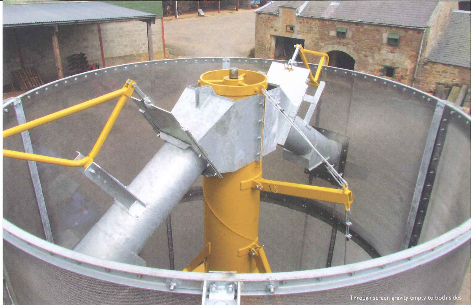
Through screen gravity empty to both sides